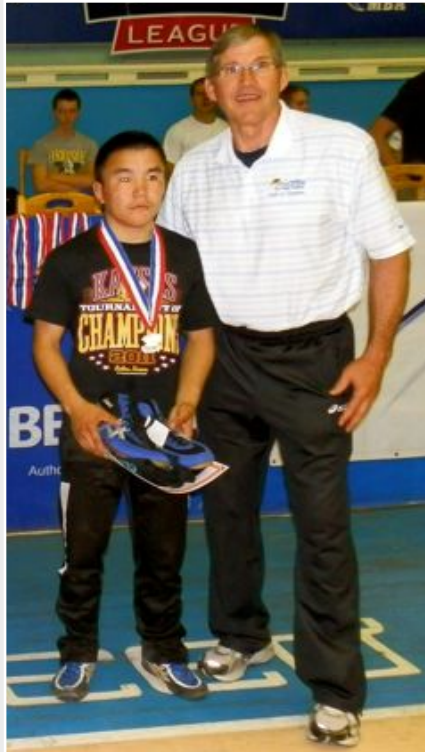
John Peterson with tournament champion from Mongolia